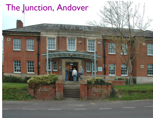
The Junction, Andover

All participants must pre-register using this form. Where appropriate, include parental permission.