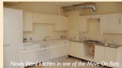
Newly fitted kitchen in one of the Move On flats

In February, staff and residents met up with the architects of the new hostel. Residents were able to input into decisions on flooring, colours and kitchen and bathrooms fittings for the hostel. Our consultation process has provided much vital information that will ensure the hostel really is a 'Place Of Change'.