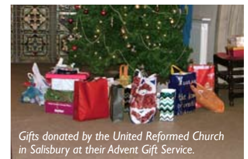
Gifts donated by the United Reformed Church in Salisbury at their Advent Gift Service.

We would like to thank all our supporters for the wonderful gifts and welfare boxes that you have donated to Alabaré and especially our Drop In Centres this Winter. We were able to distribute Christmas gifts and essential items such as toiletries and sleeping bags which are vital to so many using our centres. Our thanks too to those people