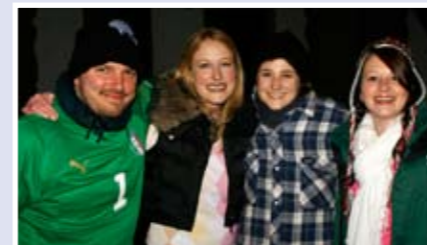
Dorset Echo staff

Our thanks as well go to bands Dogs Without Collars and Unlawfully at Large , who held concerts in Weymouth and Salisbury respectively earlier in the evening on 4th March. Both concerts were great warm ups to the Sleep Out events being held later that night, and each raised much needed funds for projects in their areas.